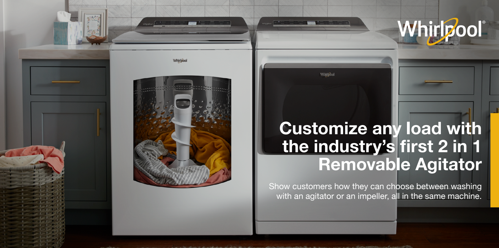
Dramatization—washing machine does not have a front facing window.