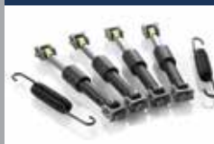
Zinc-coated springs Nickel-plated dampers