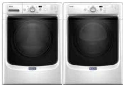
MHW3505F & ME/GD3500F

Give customers the Best Cleaning in the Industry driven by the PowerWash® system.* Quickly meet the needs of most consumers with this new Maytag® front load laundry lineup.