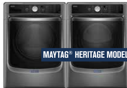
MHW8200F & ME/GD8200F

Steam-enhanced dryer cycles and options help refresh clothes and prevent wrinkles.