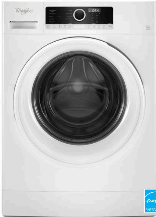
Matching Dryer: WHD3090GW

24" WASHER/ CONTRACT EXCLUSIVE MODEL 1.9 CU. FT. WASHER