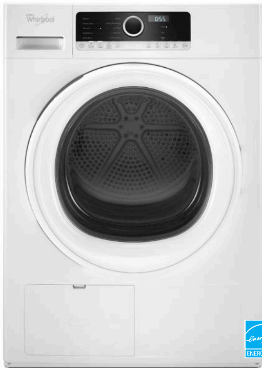
Matching Washer WFW3090GW

24" DRYER CONTRACT EXCLUSIVE MODEL | 4.3 CU. FT. HEAT PUMP DRYER