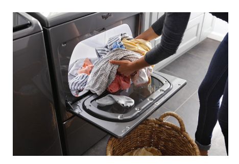
Steam Dry Cycles

A dryer with a sanitizing cycle uses higher temperatures.