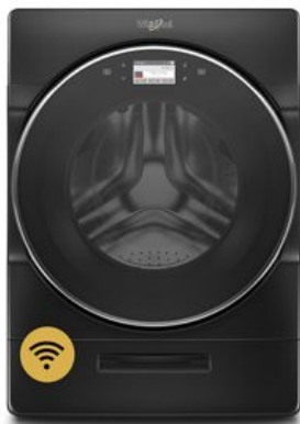
ALSO AVAILABLE / STEP UP WFW9620H

Be sure to tune into your customers' shipping priorities to bundle products across categories