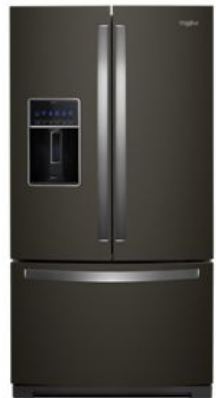
SUITE MATCH REFRIGERATOR WRF767SDH