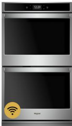
ALSO AVAILABLE / STEP UP WOD97EC0H

Be sure to tune into your customers' shipping priorities to bundle products across categories