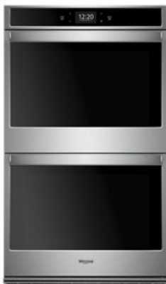
ALSO AVAILABLE / STEP UP WOD77EC7H

Be sure to tune into your customers' shipping priorities to bundle products across categories