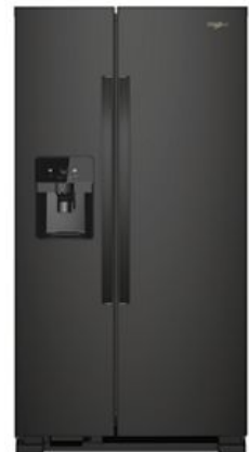
SUITE MATCH REFRIGERATOR WRS555SIH