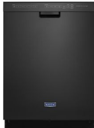
SUITE MATCH DISHWASHER MDB4949S