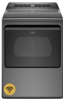
ALSO AVAILABLE / STEP UP WED6120H

Be sure to tune into your customers' shipping priorities to bundle products across categories