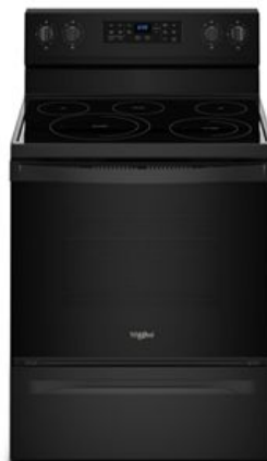
SUITE MATCH COOKING RANGE / WALL OVEN WFE550S0H