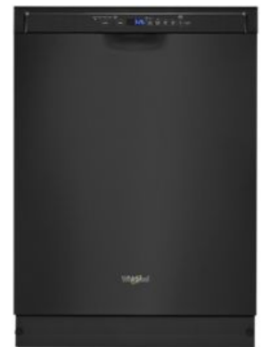
SUITE MATCH DISHWASHER WDF560SAF