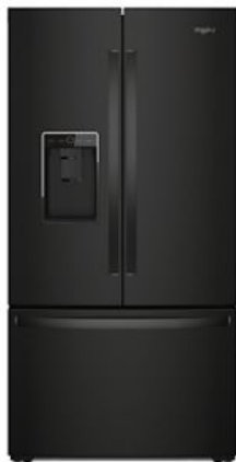
ALSO AVAILABLE / STEP UP WRF954CIH

Be sure to tune into your customers' shipping priorities to bundle products across categories