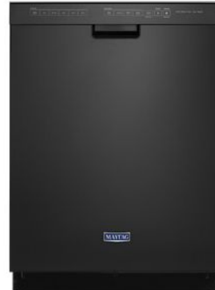
SUITE MATCH DISHWASHER MDB4949S