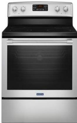
ALSO AVAILABLE / STEP UP MER8650F

Be sure to tune into your customers' shipping priorities to bundle products across categories