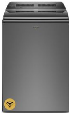
ALSO AVAILABLE / STEP UP WTW7120H

Be sure to tune into your customers' shipping priorities to bundle products across categories