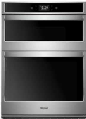
ALSO AVAILABLE / STEP UP WOC75EC7H

Be sure to tune into your customers' shipping priorities to bundle products across categories