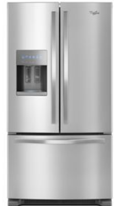
SUITE MATCH REFRIGERATOR WRF555SDF