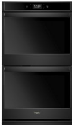
ALSO AVAILABLE / STEP UP WOD77EC0H

Be sure to tune into your customers' shipping priorities to bundle products across categories