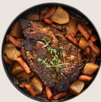
No Preheat Slow Cook