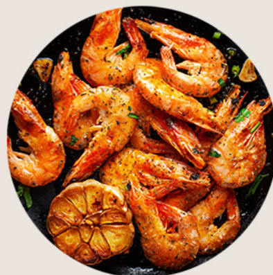
No Preheat Air Fry