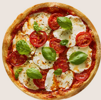
Fresh Pizza Mode

Consistent results with optimal heating temperatures