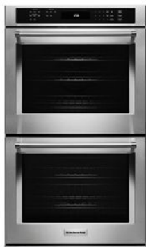
SUITE MATCH COOKING RANGE / WALL OVEN KODE300E

Be sure to tune into your customers' shopping priorities to bundle products across categories