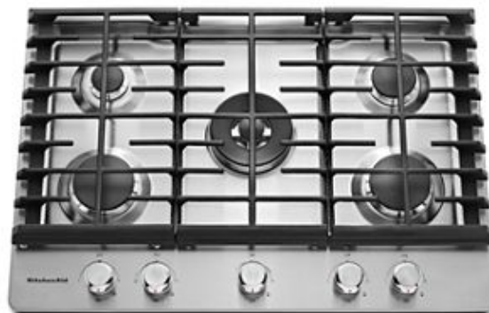
SUITE MATCH COOKING COOKTOP / MICROWAVE / VENTILATION KCGS550E