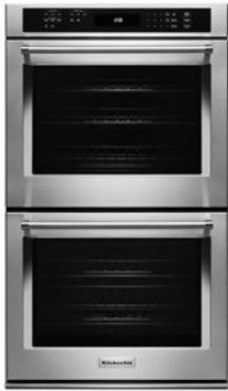
SUITE MATCH COOKING RANGE / WALL OVEN KODE300E

Be sure to tune into your customers' shopping priorities to bundle products across categories