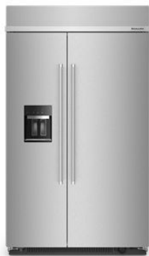
ALSO AVAILABLE / STEP UP KBSD708M

Be sure to tune into your customers' shopping priorities to bundle products across categories