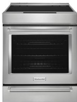
SUITE MATCH COOKING RANGE / WALL OVEN KSIS730P