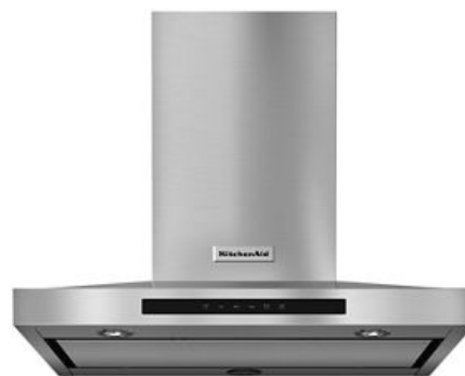
SUITE MATCH COOKING COOKTOP / MICROWAVE / VENTILATION KVWB600H