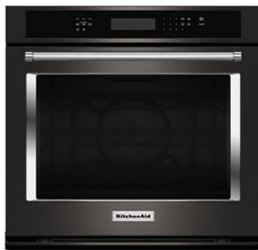
SUITE MATCH COOKING RANGE / WALL OVEN KOSE500E