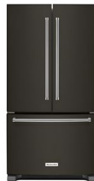
SUITE MATCH REFRIGERATOR KRFC302E