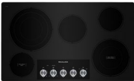
ALSO AVAILABLE / STEP UP KCES556H

Be sure to tune into your customers' shopping priorities to bundle products across categories