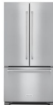
SUITE MATCH REFRIGERATOR KRFC302E