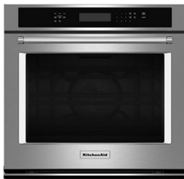
SUITE MATCH COOKING RANGE / WALL OVEN KOSE500E