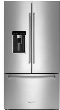
SUITE MATCH REFRIGERATOR KRFC704F