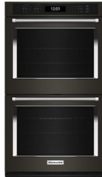
SUITE MATCH COOKING RANGE / WALL OVEN KOED530P