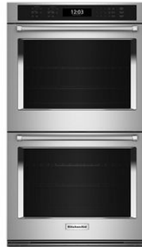
SUITE MATCH COOKING RANGE / WALL OVEN KOED530P