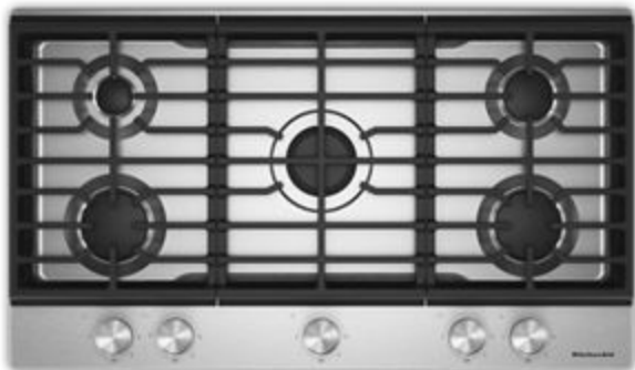
ALSO AVAILABLE / STEP UP KCGK336S

Be sure to tune into your customers' shopping priorities to bundle products across categories