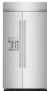
SUITE MATCH REFRIGERATOR KBSD742S