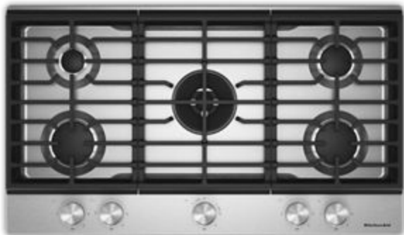
ALSO AVAILABLE / STEP UP KCGK536S

Be sure to tune into your customers' shopping priorities to bundle products across categories