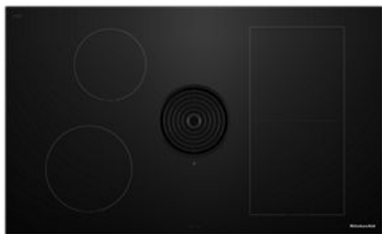
ALSO AVAILABLE / STEP UP KCID936S

Be sure to tune into your customers' shopping priorities to bundle products across categories