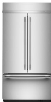
SUITE MATCH REFRIGERATOR KBFN542S