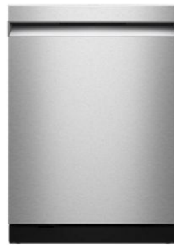
SUITE MATCH DISHWASHER KDPS624S