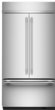
SUITE MATCH REFRIGERATOR KBFN542S