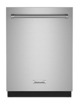
SUITE MATCH DISHWASHER KDTM604K