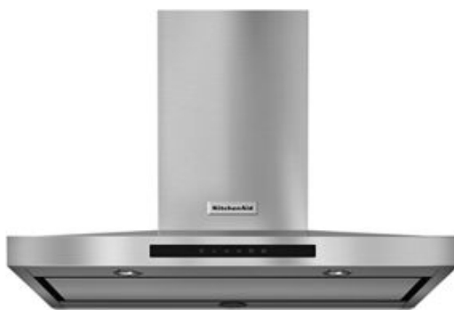
SUITE MATCH COOKING RANGE / WALL OVEN KVWB606D