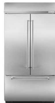
SUITE MATCH REFRIGERATOR KBFN502E