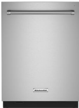
ALSO AVAILABLE / STEP UP KDTM804K

Be sure to tune into your customers' shopping priorities to bundle products across categories