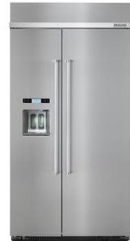
SUITE MATCH REFRIGERATOR KBSD602E