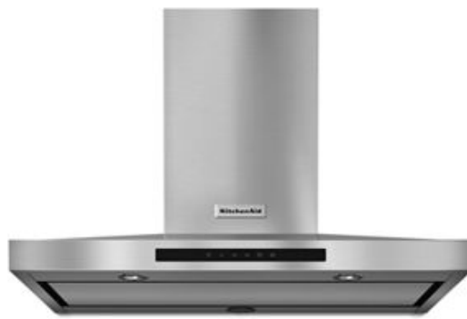
SUITE MATCH COOKING RANGE / WALL OVEN KVWB606D