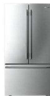
SUITE MATCH REFRIGERATOR KRFF336S