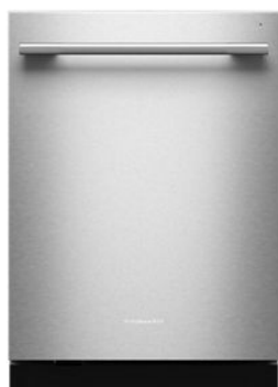
ALSO AVAILABLE / STEP UP KDTS624S

Be sure to tune into your customers' shopping priorities to bundle products across categories