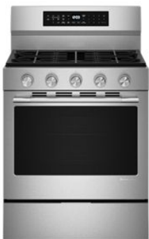
ALSO AVAILABLE / STEP UP KFGS530S

Be sure to tune into your customers' shopping priorities to bundle products across categories