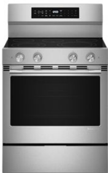
ALSO AVAILABLE / STEP UP KFES530S

Be sure to tune into your customers' shopping priorities to bundle products across categories