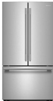
SUITE MATCH REFRIGERATOR KRFF336S