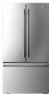
SUITE MATCH REFRIGERATOR KRFF336S