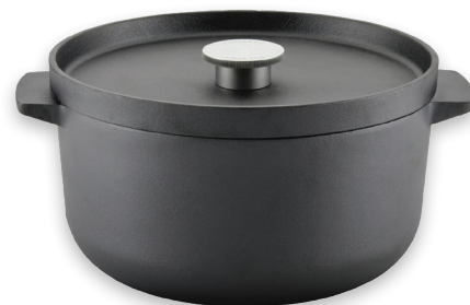
Kitchenaid® Seasoned 6-Quart Cast Iron Dutch Oven (Pre-Seasoned Cast Iron)