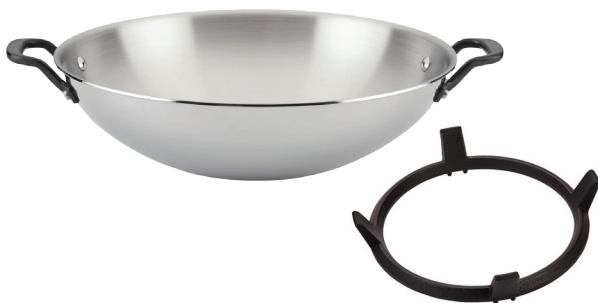
Wok + Wok Stand (W10216179)