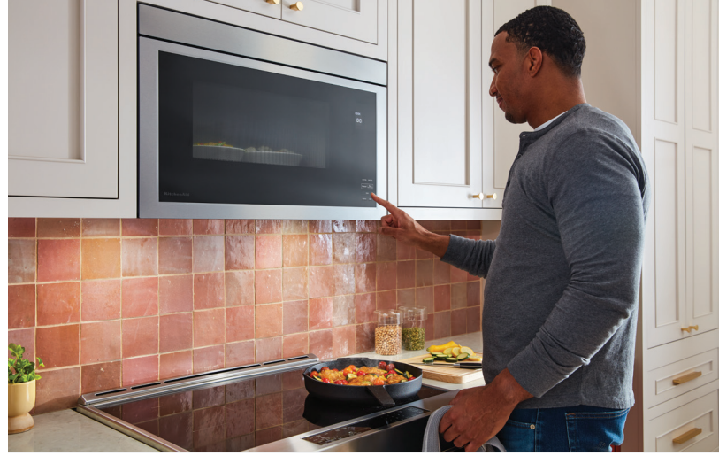
KMMF530PWH/BS/PS & KMMF730PPS