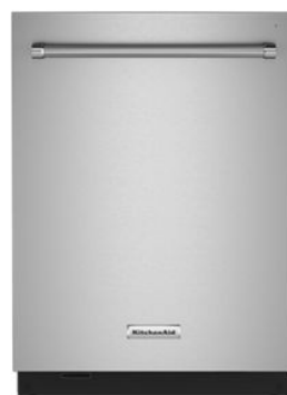
SUITE MATCH DISHWASHER KDTM704K