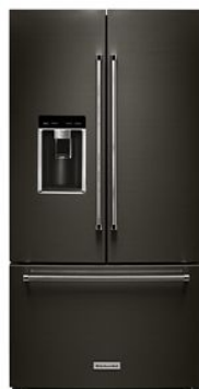
SUITE MATCH REFRIGERATOR KRFC704E