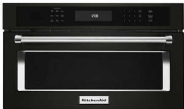
ALSO AVAILABLE / STEP UP KMBP107E

Be sure to tune into your customers' shopping priorities to bundle products across categories