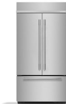
SUITE MATCH REFRIGERATOR KBFN542S