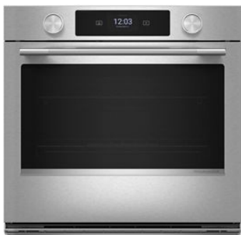
SUITE MATCH COOKING RANGE / WALL OVEN KOES730S

Be sure to tune into your customers' shopping priorities to bundle products across categories