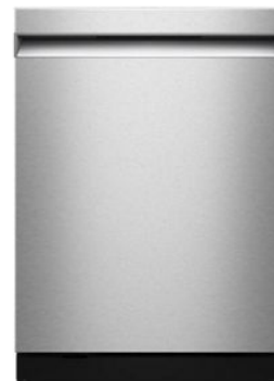
SUITE MATCH DISHWASHER KDPS624S