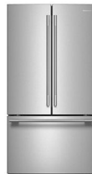
SUITE MATCH REFRIGERATOR KRFF336S