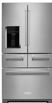
SUITE MATCH REFRIGERATOR KRMF706E