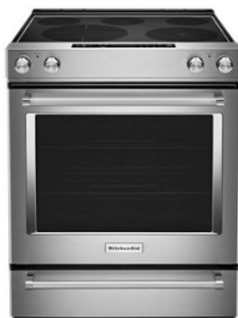
SUITE MATCH COOKING RANGE / WALL OVEN KSEG700E

Be sure to tune into your customers' shopping priorities to bundle products across categories