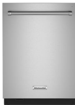
SUITE MATCH DISHWASHER KDTM704K