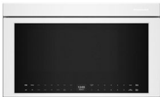
ALSO AVAILABLE / STEP UP KMMF530P

Be sure to tune into your customers' shopping priorities to bundle products across categories