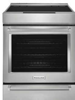
SUITE MATCH COOKING RANGE / WALL OVEN KSIS730P