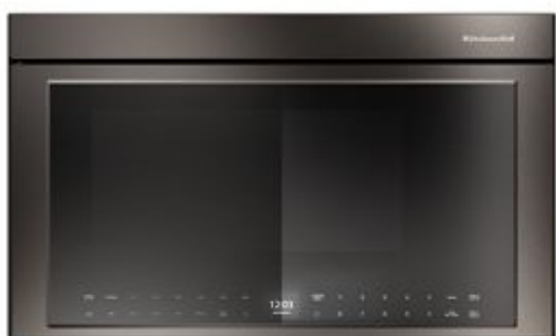
ALSO AVAILABLE / STEP UP KMMF730P

Be sure to tune into your customers' shopping priorities to bundle products across categories