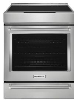
SUITE MATCH COOKING RANGE / WALL OVEN KSIS730P