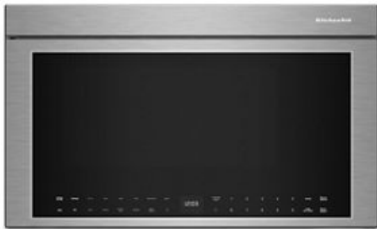
ALSO AVAILABLE / STEP UP KMMF730P

Be sure to tune into your customers' shopping priorities to bundle products across categories