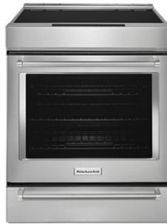
SUITE MATCH COOKING RANGE / WALL OVEN KSIS730P