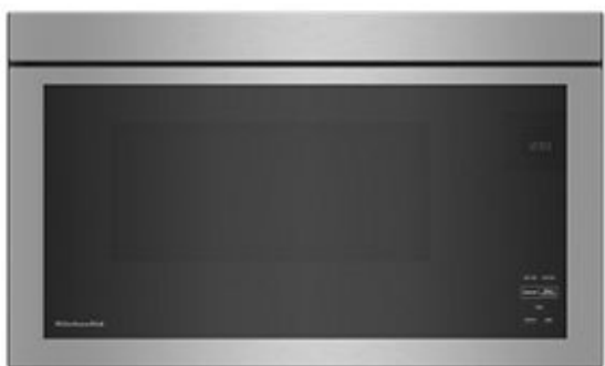
ALSO AVAILABLE / STEP UP KMMF330P

Be sure to tune into your customers' shopping priorities to bundle products across categories