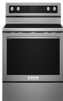
SUITE MATCH COOKING RANGE / WALL OVEN KFEG500E