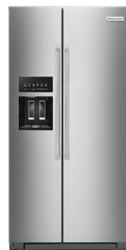
SUITE MATCH REFRIGERATOR KRSC703H