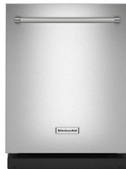
SUITE MATCH DISHWASHER KDTF924P