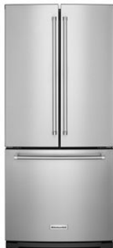
SUITE MATCH REFRIGERATOR KRFF300E