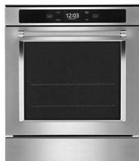
ALSO AVAILABLE / STEP UP KOSC504P

Be sure to tune into your customers' shopping priorities to bundle products across categories