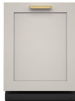
SUITE MATCH DISHWASHER KDTE924P