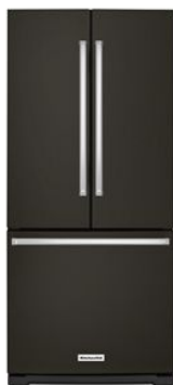
SUITE MATCH REFRIGERATOR KRFF300E