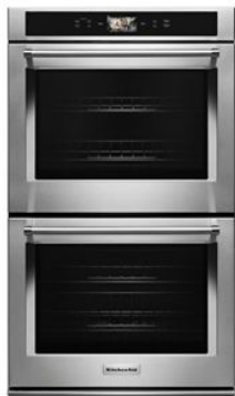
ALSO AVAILABLE / STEP UP KODE900H

Be sure to tune into your customers' shopping priorities to bundle products across categories