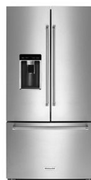
SUITE MATCH REFRIGERATOR KRFC704F