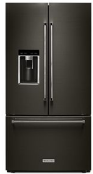
SUITE MATCH REFRIGERATOR KRFC704F