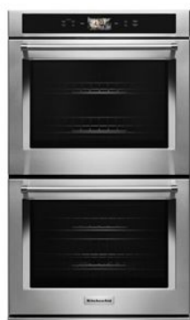
ALSO AVAILABLE / STEP UP KODE900H

Be sure to tune into your customers' shopping priorities to bundle products across categories