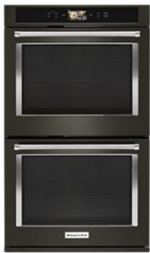
ALSO AVAILABLE / STEP UP KODE900H

Be sure to tune into your customers' shopping priorities to bundle products across categories