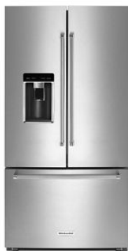
ALSO AVAILABLE / STEP UP KOCE900H

Be sure to tune into your customers' shopping priorities to bundle products across categories