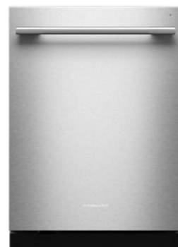
SUITE MATCH DISHWASHER KDTS624S