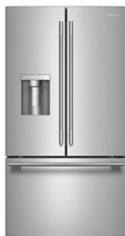
SUITE MATCH REFRIGERATOR KRFF436S