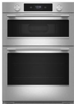
ALSO AVAILABLE / STEP UP KOEC930S

Be sure to tune into your customers' shopping priorities to bundle products across categories