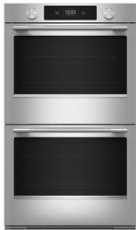
ALSO AVAILABLE / STEP UP KOED930S

Be sure to tune into your customers' shopping priorities to bundle products across categories