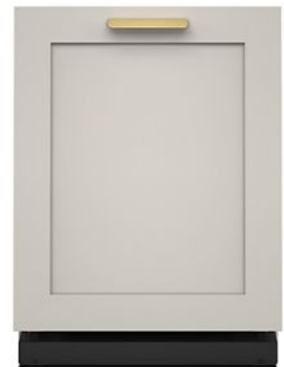
SUITE MATCH DISHWASHER KDTF924P