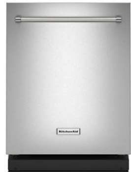
SUITE MATCH DISHWASHER KDTE924P