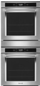
ALSO AVAILABLE / STEP UP KODC504P

Be sure to tune into your customers' shopping priorities to bundle products across categories