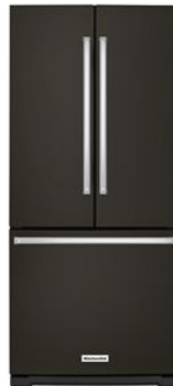
SUITE MATCH REFRIGERATOR KRFF300E